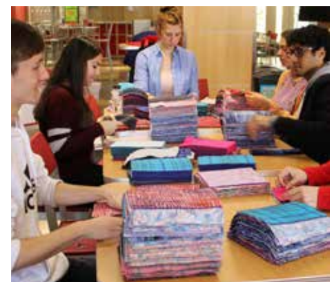
Days for Girls kits