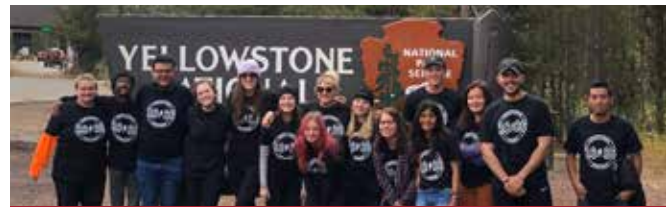
Wildlife Habitat Conservation