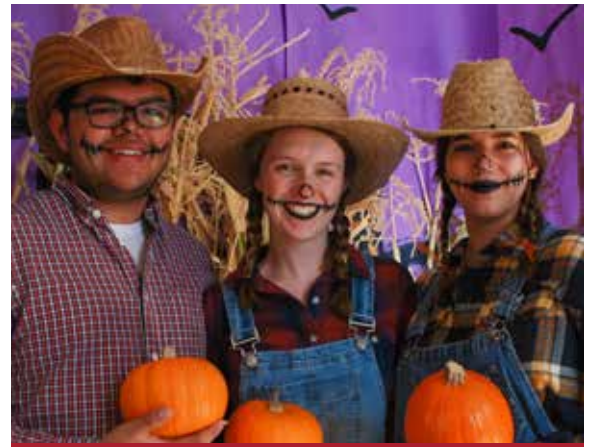
Officer's Hollow Halloween

Sustainability: Individual & Systemic Scales - Cancelled due to COVID-19