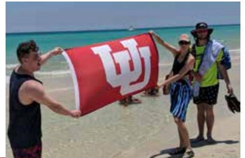
Cuba - Summer 2019