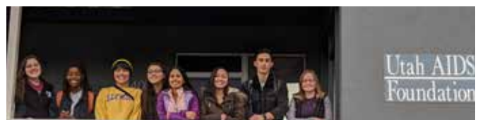
Local HIV & AIDS team experience in SLC

Even though all spring break experiences were cancelled due to COVID-19 travel restrictions, the spring teams still created local experiences for their participants.