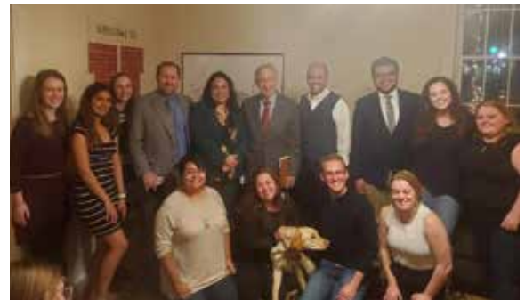
Service House Dialogue